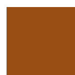
Light Brown - 470