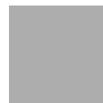
Grey - 429