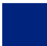
Royal Blue - 280