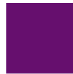
Purple - 2613