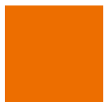
Orange - 021