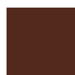
Brown - 4695