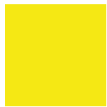
Lemon - 102