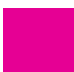
Bright Pink - Rhodamine