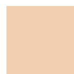
Beige - 719