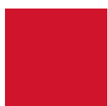
Red - 186