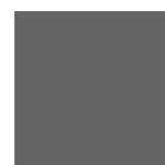
charcoal - cool 11